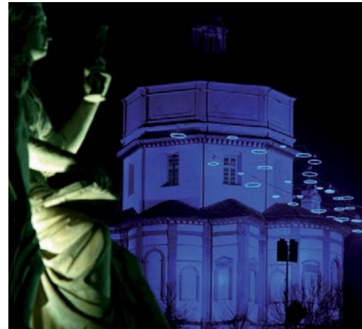
Luci d'Artista "Little Blu Spirit" by Rebecca Horn

Priority: according to the approach of the Culture Forum of EURO CITIES, Torino will work to improve the concept of culture as a boost for economic development.