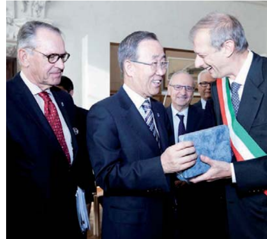
Ban Ki-moon in Torino