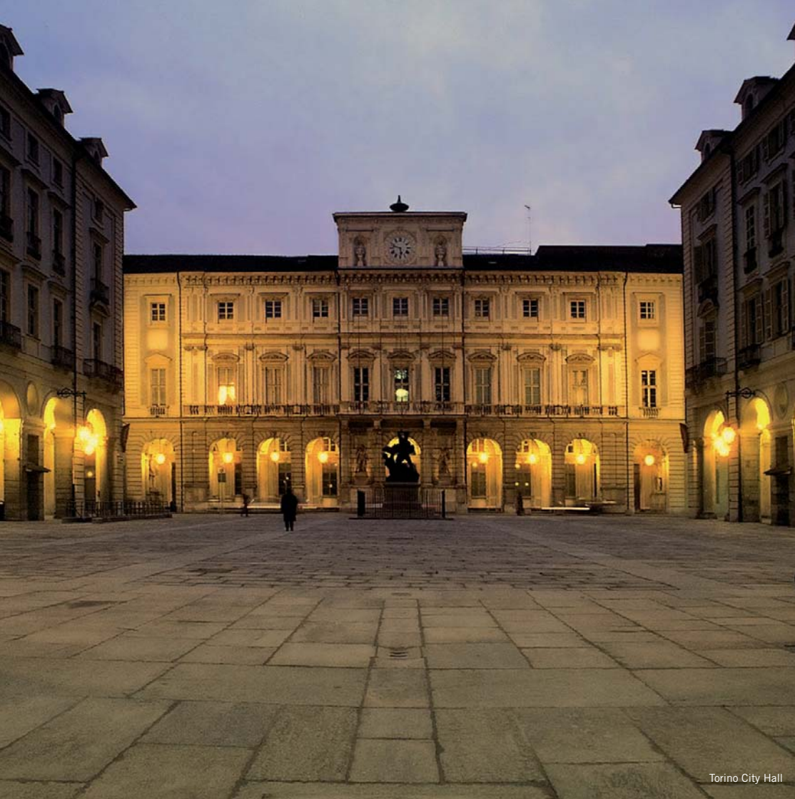
Torino City Hall