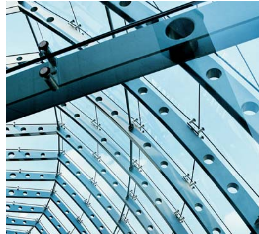
Pininfarina Engineering Centre in Cambiano (To)