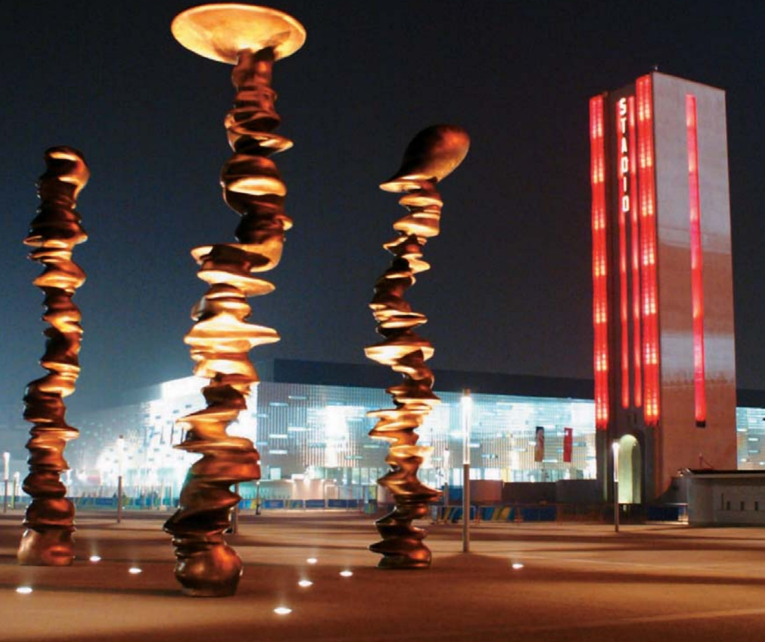
Piazza d'Armi "Punti di Vista" by Tony Cragg