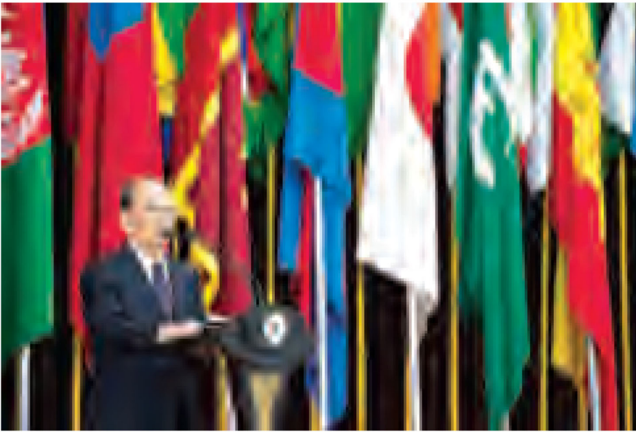
President U Thein Sein delivers speech at 60 th Asian African Summit. www.aacc2015.id

Summit 60 years ago in Bandung, the city of Asian African Unity, the president added.