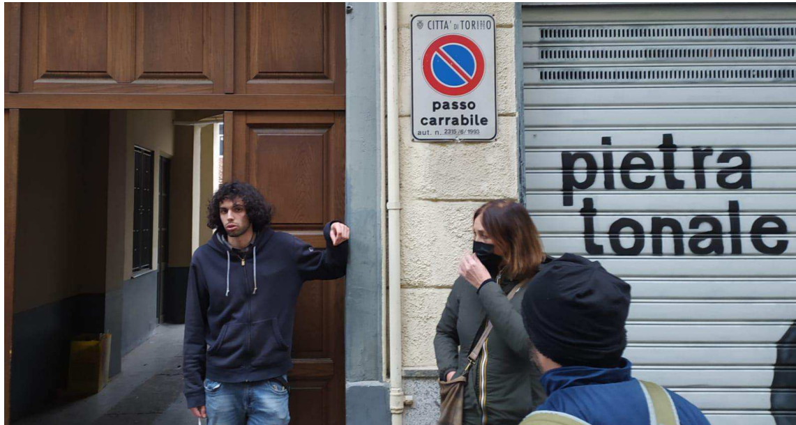
Pietra Tonale - research and experimentation laboratory of improvised and composed music