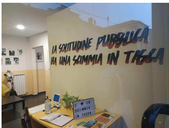
La scimmia in tasca - Cultural club and coworking